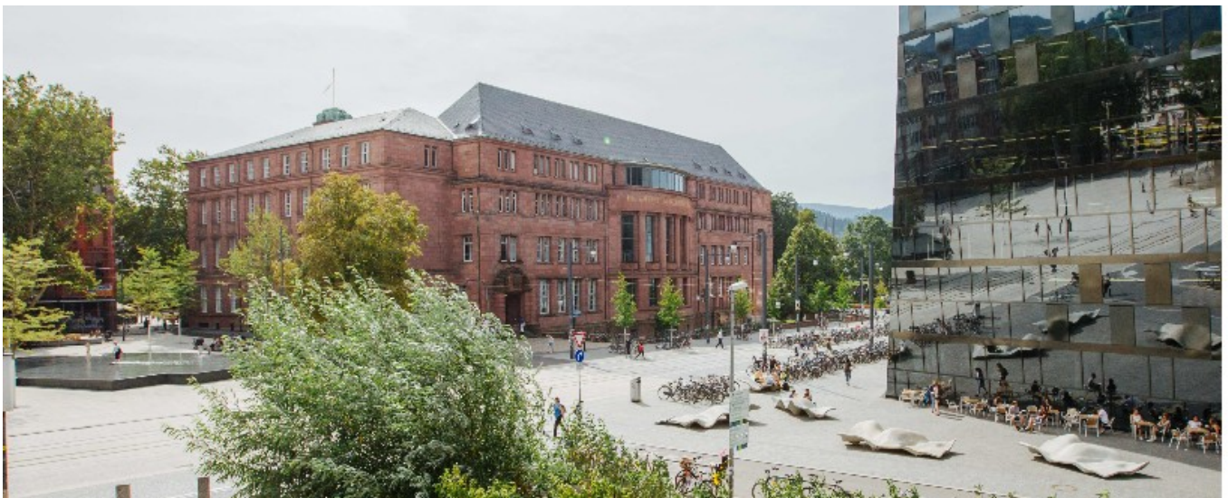
University of Freiburg