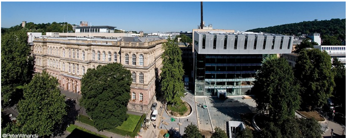
RWTH Aachen University