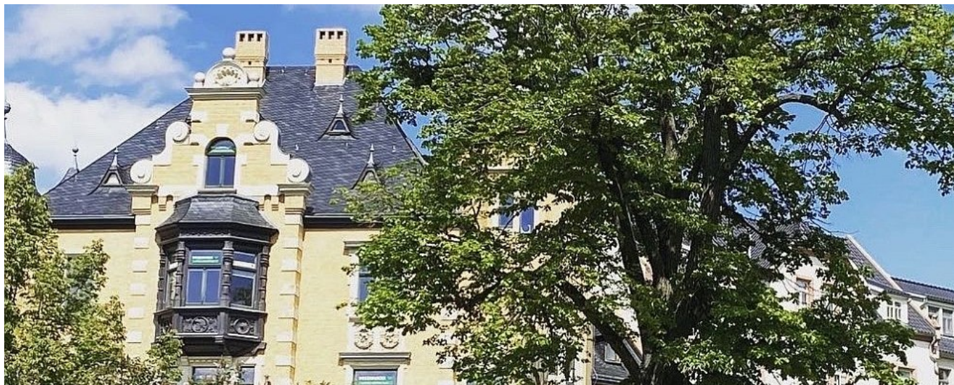
Institut für deutsche Sprache und Kultur e. V. (Halle/ Saale)