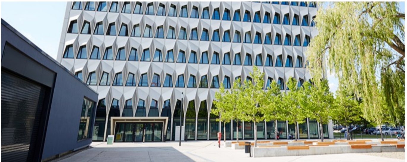
Darmstadt University of Applied Sciences