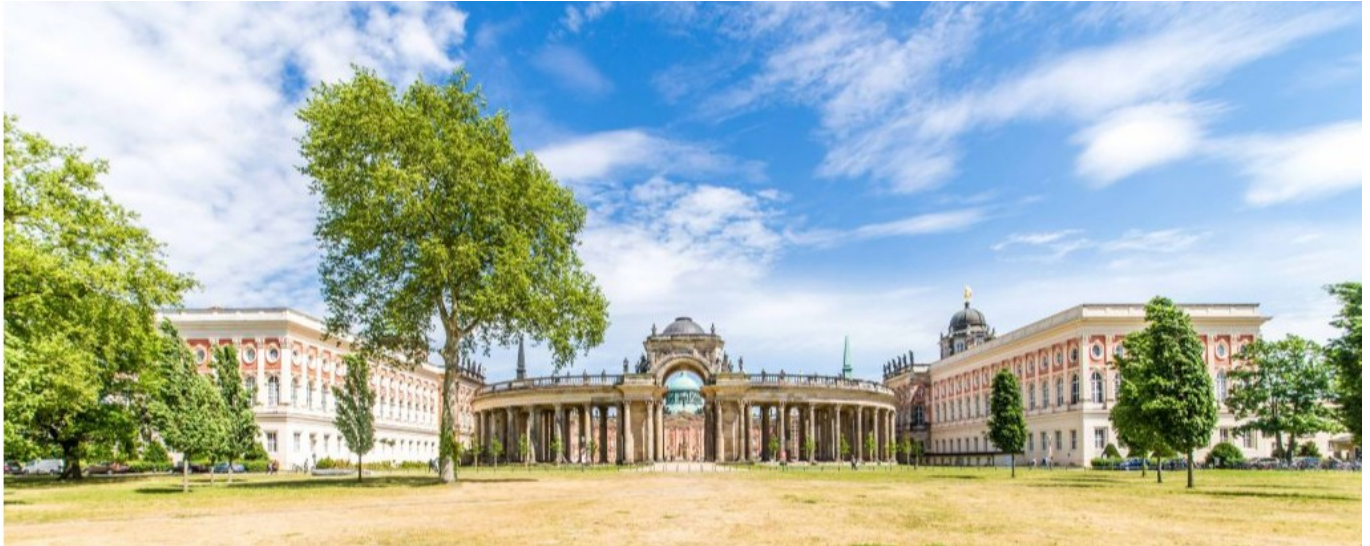
University of Potsdam