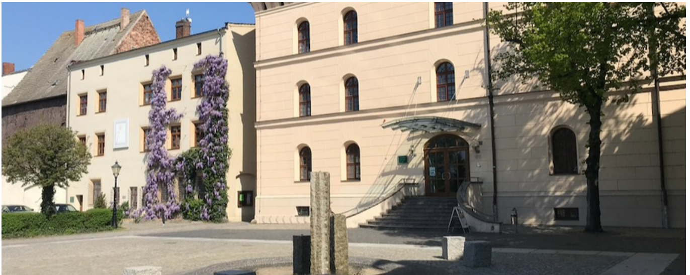
Institut für deutsche Sprache und Kultur e. V. in der Stiftung Leucorea

© Institut für deutsche Sprache und Kultur e. V.