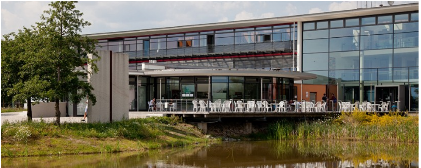
Hof University campus

Founded in 1994, our university offers a very attractive study environment with its modern architecture and its state-of-the-art classrooms, laboratories, and dormitories. You will receive a first-class, hands-on education here.