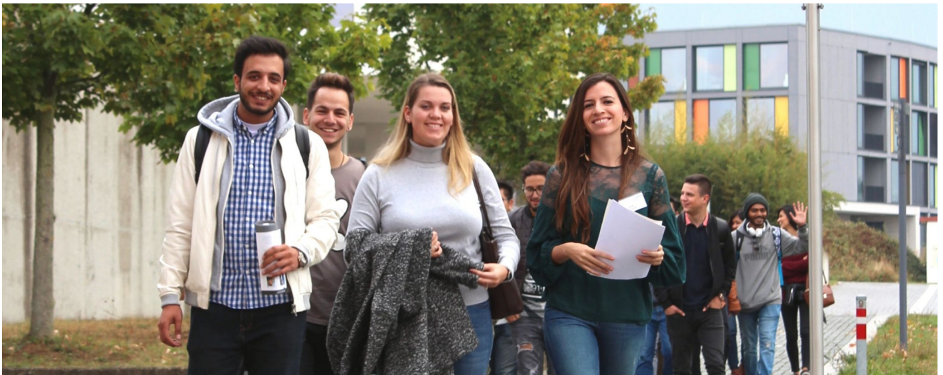
International students on Hof University campus