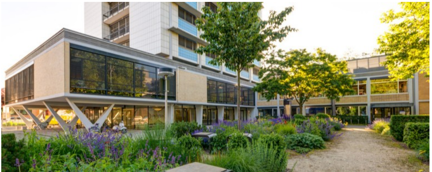
Physics main building