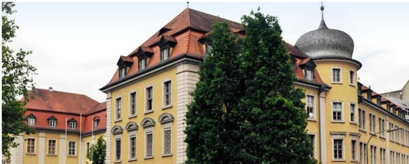
Campus in Würzburg