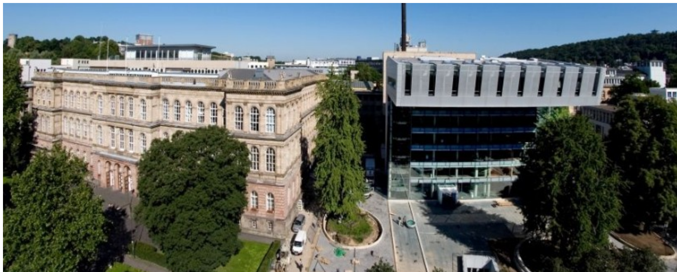
RWTH Aachen University