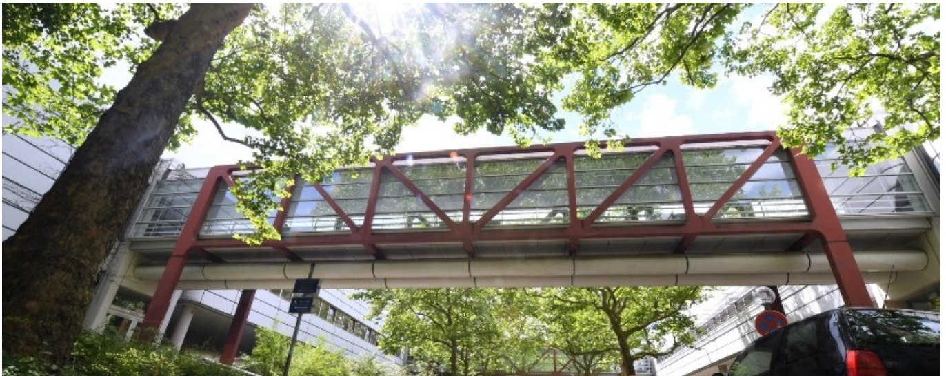
Department of Physics at Freie Universität Berlin