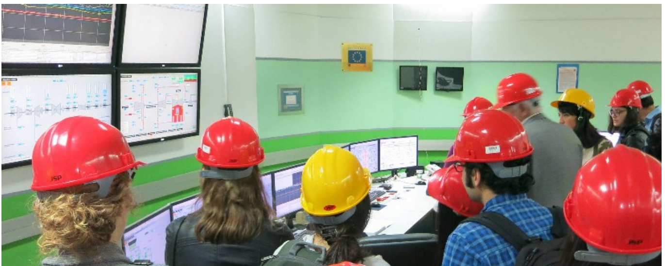
Urban Management at TU Berlin: Management of Mobility