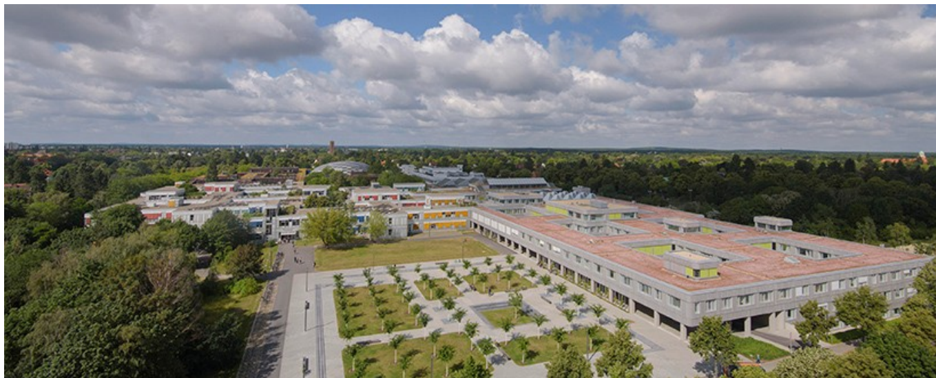
Aerial view of Freie Universität Berlin