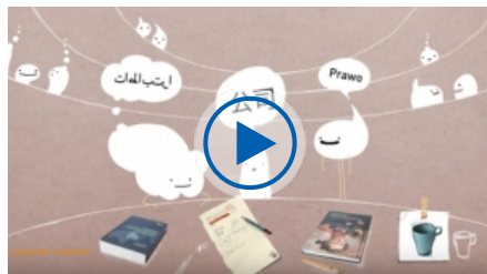
Image video of the Department of Social and Cultural Sciences

EU institutions, EU policy, digitalisation and intercultural communication – the ICEUS MA programme in Fulda provides a comprehensive scientific understanding and a broad knowledge of EU integration policy, especially after fascinating trips to Strasbourg and Brussels. With this background and German and English as the languages of instruction, students will have broad career opportunities. After the mandatory internship, these perspectives will become much clearer.