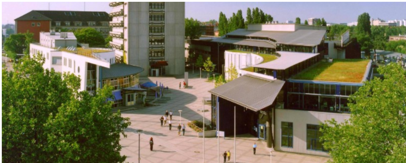
Mannheim campus, Hochschule Mannheim — University of Applied Sciences