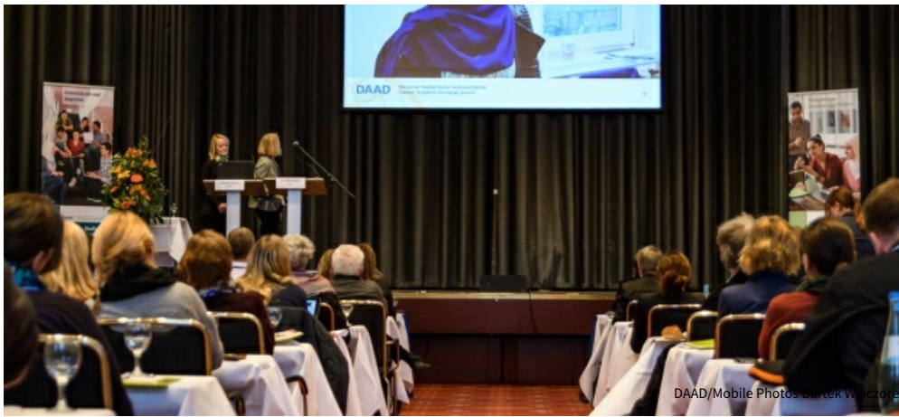
Refugees reported how they profit from the Integra and Welcome programmes in two short films