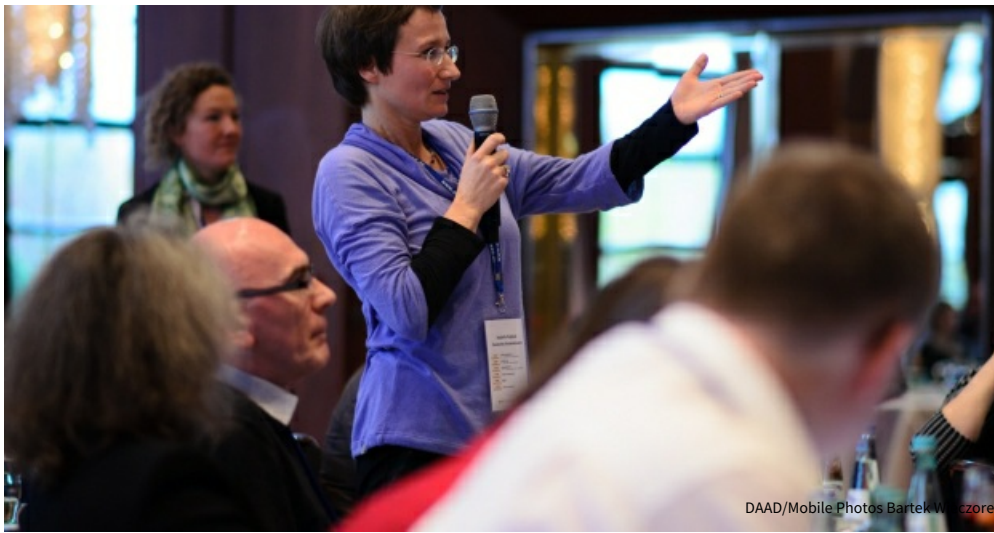
Lively discussion: Many of the 260 participants contributed actively to the debates