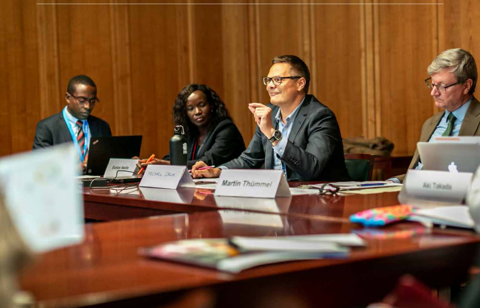
Photo. Participants discuss during the workshop 'finance models and strategic partnerships'