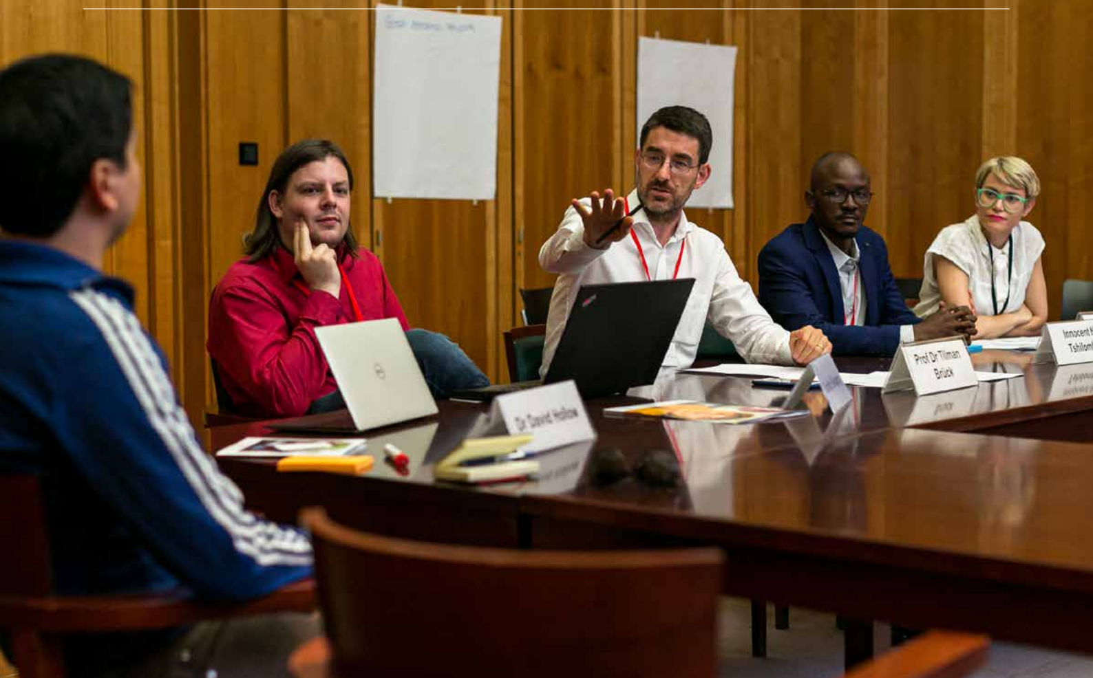
Photo. Participants discuss during the workshop 'research and data'