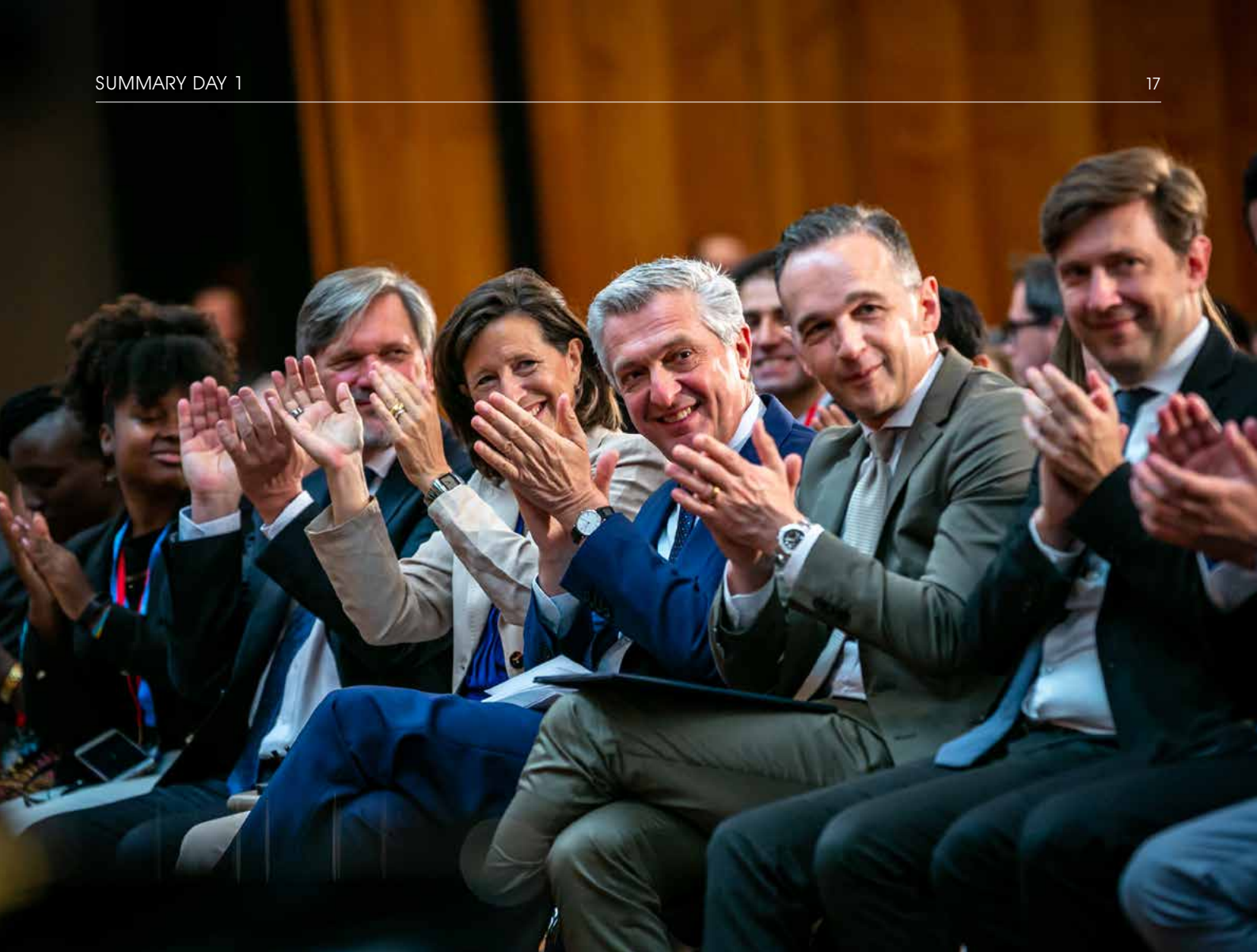
Photo: Filippo Grandi and Heiko Maas at the opening of the conference