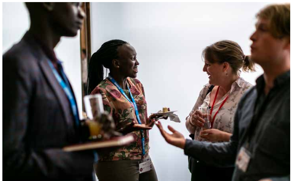
Photo. Participants discuss during the coffee break