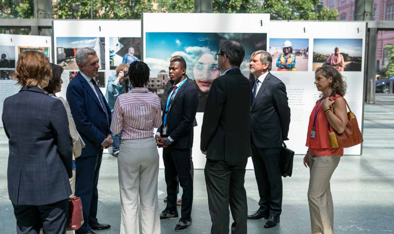
Photo. Filippo Grandi speaks with refugee students at the opening of the exhibition