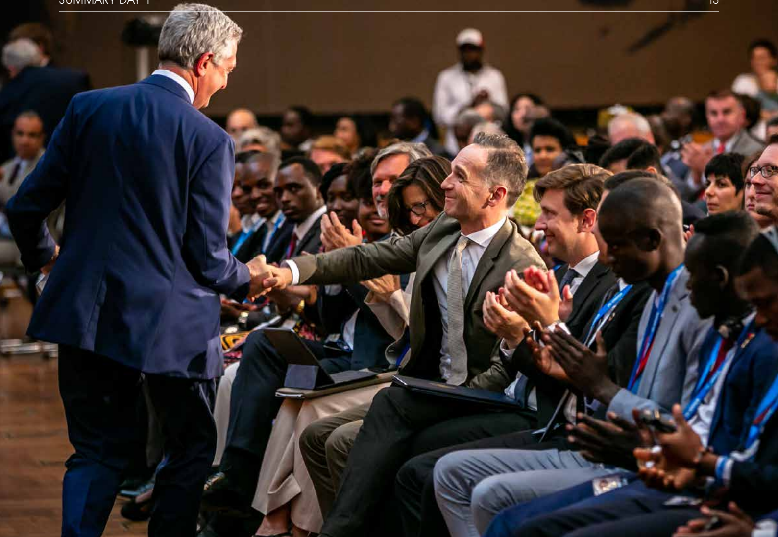
Photo: Filippo Grandi, UN High Commissioner for Refugees arrives at the conference and is greeted by Heiko Maas, the German Minister of Foreign Affairs