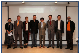
Group photo of organizers (CUHK School of Architecture, The German Consulate & DAAD Hong Kong &