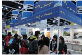
Study in Europe Booth