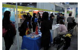
DAAD counter at the Education and Career Expo 2011