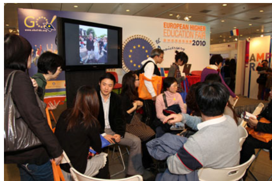
Alumni sharing sessions from EHEF 2010

The 'Language Snacks' was a blast last year. Why not take this chance to 'taste' some of the European languages? Though programs taught in English are always the highlight of the fair, languages are equally necessary if you want to experience the diversity of European cultures. Visitors will also have the opportunity to meet former international students in Europe at the "Alumni Corner" and hear about their experiences.