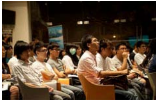
Students listening attentively to the speakers' presentation.