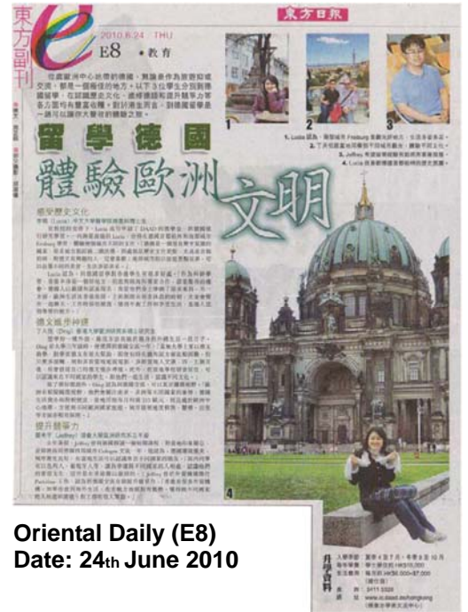
Oriental Daily (E8) Date: 24th June 2010