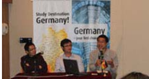
Three Alumni shared their experience with students.