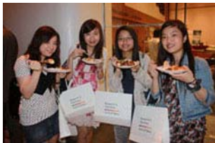
Students tasting German specialties while exchanging ideas.

Germany and get first-hand information about living and studying in Germany. The possibility to taste German food specialties was particularly welcomed by the participants. On occasion of the event, 3 students had been interviewed by the local Newspaper Oriental Daily about their experiences in Germany. Please read the excerpts below: